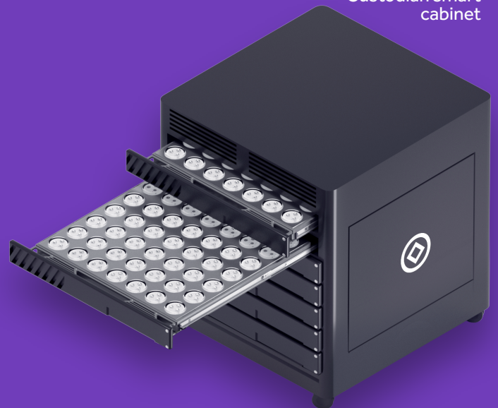
Custodian smart cabinet