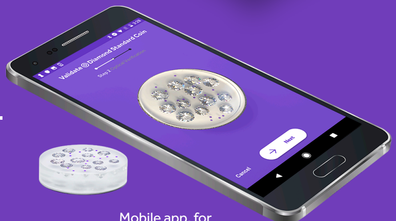
Mobile app, for authentication, audit, and transactions